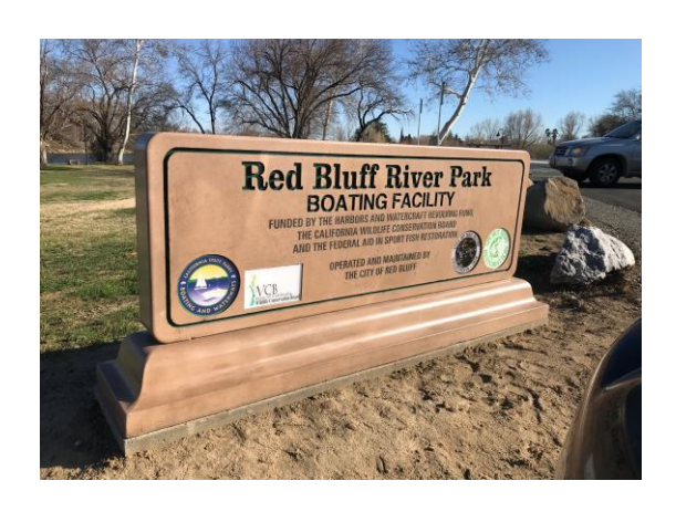
Red Bluff River Park BLF project credit sign

The Division of Boating and Waterways (DBW) provided $1,690,377.90 in grant funding for improvements to the Red Bluff Boat Launching Facility project on the Sacramento River in Tehama County. This was a partnership between DBW, the Wildlife Conservation Board (WCB), and the City of Red Bluff (City). DBW provided funding to complete the planning and construction of a new two-lane boat launch ramp, boarding floats, slope protection, an access roadway, sidewalks, curbs and lighting near the boat ramp, and a project credit sign. WCB funded partial mitigation, restroom, trails, lighting, and parking improvement expenses. The City of Red Bluff funded the restroom and shade pavilion. The improvements will provide river access to the City of Red Bluff.