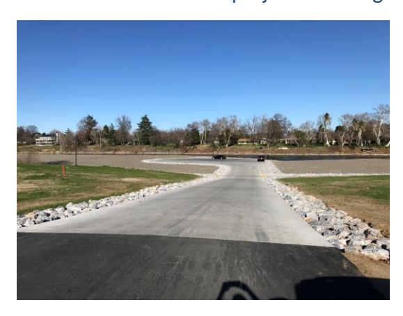
Access roadway from the parking area to the boat ramp