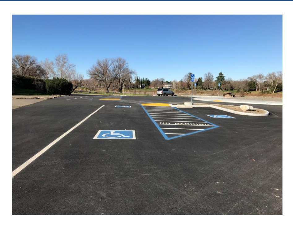
ADA parking, curbs, and sidewalk at the boater parking area