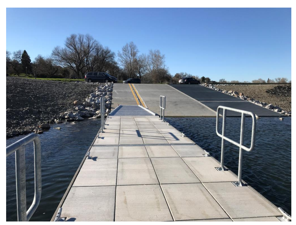
Boarding float and boat launch ramp