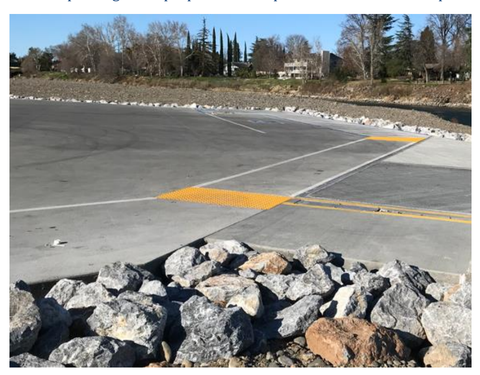
Accessible path of travel at the top of the boat launch ramp